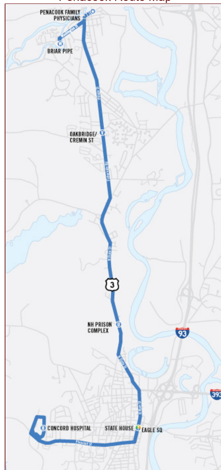
Penacook Route Map

(Click the image above to open a larger view)